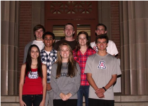
Please help us welcome the 2013/2014 Freshman Engineering Council.